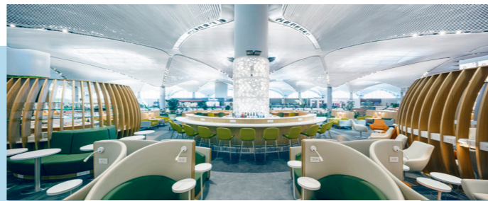
7th SkyTeam lounge opened in Istanbul Airport